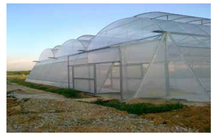
Figure 3. Locally produced Malaysian plastic houses designed to fit local climate by Wageningen UR Greenhouse Horticulture.