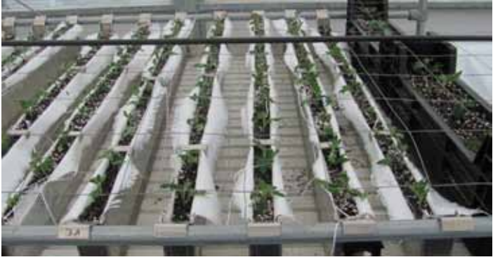
Figure 4. Cassettebed system for cuttings.

The ultimate goal is to grow plants. Examples are the aeroponics system Fleurago and the Cassettebed system.